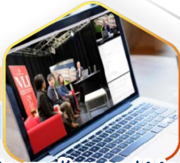
Journalism and Media Studies Centre