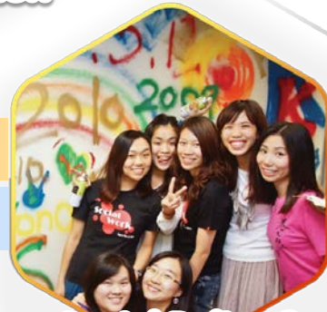
Social Policy & Social Development