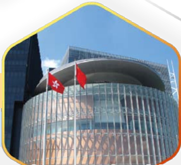
Politics and Public Administration