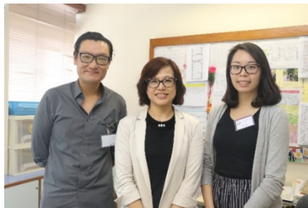
Interviews with staff of TWGHs Tsui Tsin Tong School