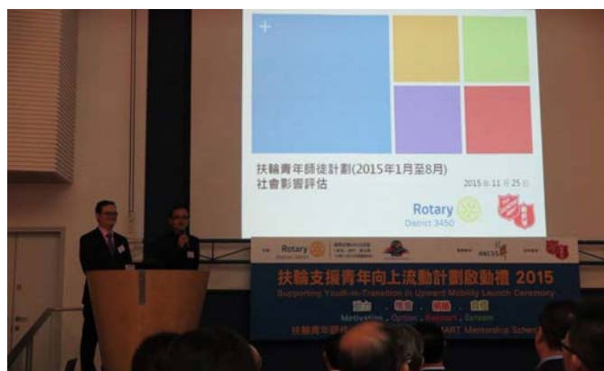
The Salvation Army, as the 1st NGO in Hong Kong, tried out their SIA with the framework co-developed by the HKU and the HKCSS