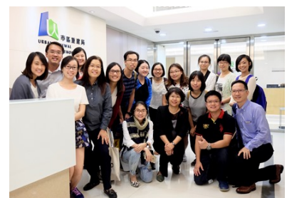
Agency Visit to Urban Renewal Authority