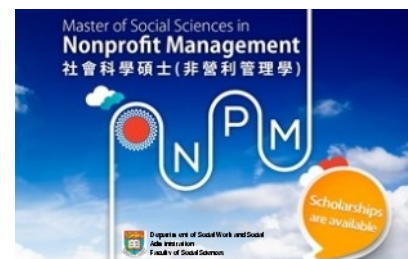
Master of Social Sciences in Nonprofit Management

For detail of the programme, please click here .