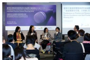
➢ Resources and capacity building from funders' perspective