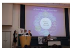
▶ Presentation by HKCSS