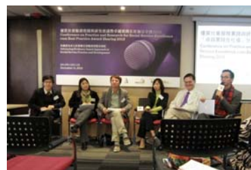
➢ NGOs sharing on resources and capacity building for practice research