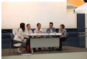
▶ Local NGOs sharing on evidence-based practice and service excellence