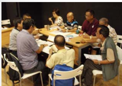
Elderly rights advocacy groups discussed elderly related policy