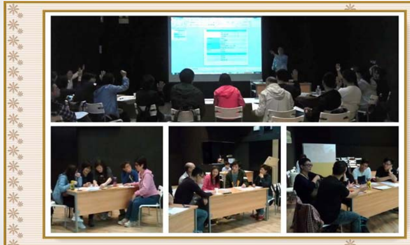
Professionals involved in elderly services shared their experiences at the workshop