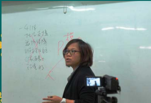
Using London Citizen's organization method as an example