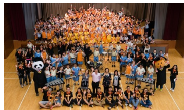
Strategic Collaboration between Nonprofits and Business: The Case of St James' Settlement and Octopus Cards Limited