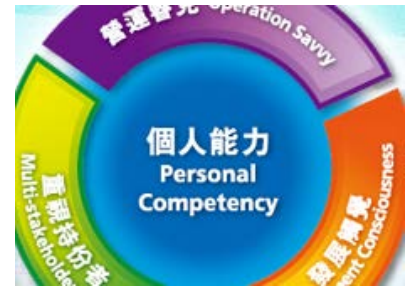
NGO Strategic Leadership Competencies Project

To build leadership competencies of NGOs in the social welfare sector in Hong Kong, the HKU-HKJC ExCEL3 Project and HKCSS Institute formed a team to conduct competency modeling research on strategic leadership of NGOs in the social welfare sector (October 2012 – December 2013). The team interviewed the CEOs of 16 NGOs of which the average annual budget was above HK$50 million. 12 competencies were identified through... Read More