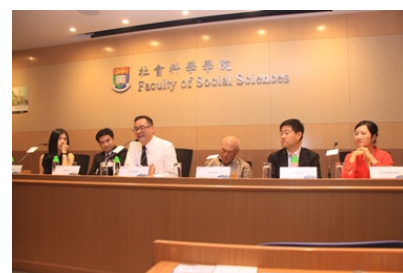
Forum on Effective Philanthropy: Multiple Perspectives on Strategy and Impact Evaluation