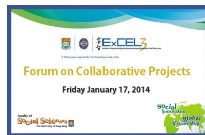
ExCEL3 Forum on Collaborative Project on January 17, 2014

ExCEL3 is going to launch the Philanthropy Lab. We aim to provide advance training on the evaluation and measurement of effectiveness in philanthropy and various topics on granters/grantees relationships. The Lab serves as a hub and a platform to enhance the knowledge and interaction of stakeholders in the philanthropy field.