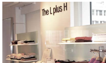
Branding a Social Enterprise: The Case of L plus H Fashion