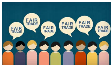
Fair Trade Movement in Hong Kong